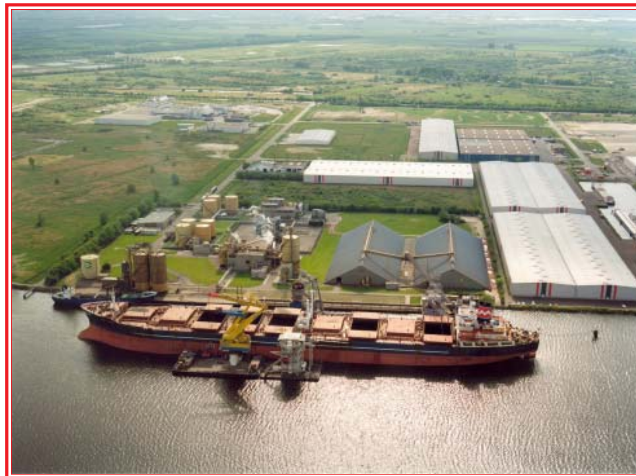
Cargill Multiseed Plant, American Harbor, The Netherlands

T his facility features four TRAMCO grain receiving 42"-32" G-Model conveyors. There are about 700 ft. of conveyors total filling their flat storage with canola rape seed at 500 metric ton per hour. In the last few years, TRAMCO has installed a new shuttle conveyor with a rubber zipper top on the mill load-out, new conveyors on top of the mill silos, and several Bulk-Flos feeding extraction and taking away from extraction.