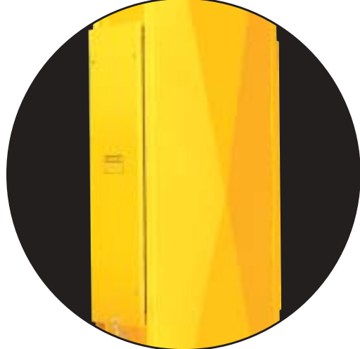
Explosion vent in sides of leg casing