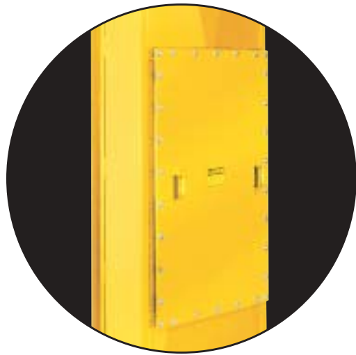
Elevator bucket service door placed to customer's specification

Split hood for easy replacement of liners