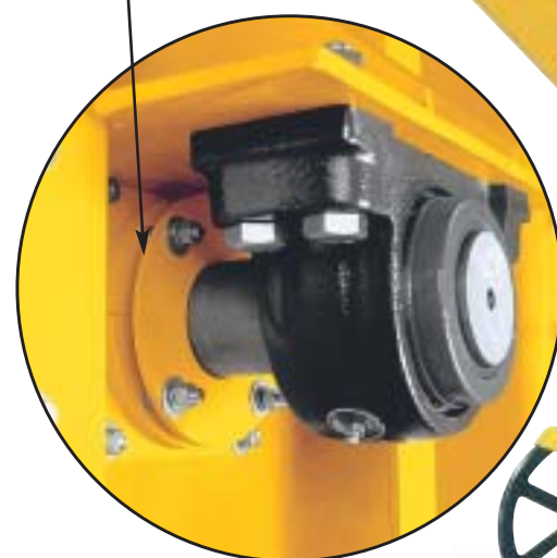
Heavy-duty long life pillow block roller bearings